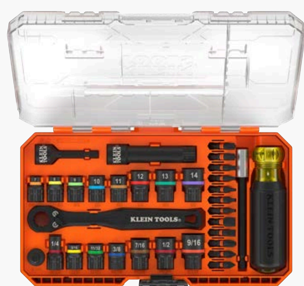
65302KNECT 33-Piece SAE and Metric Pass-Through Socket Set