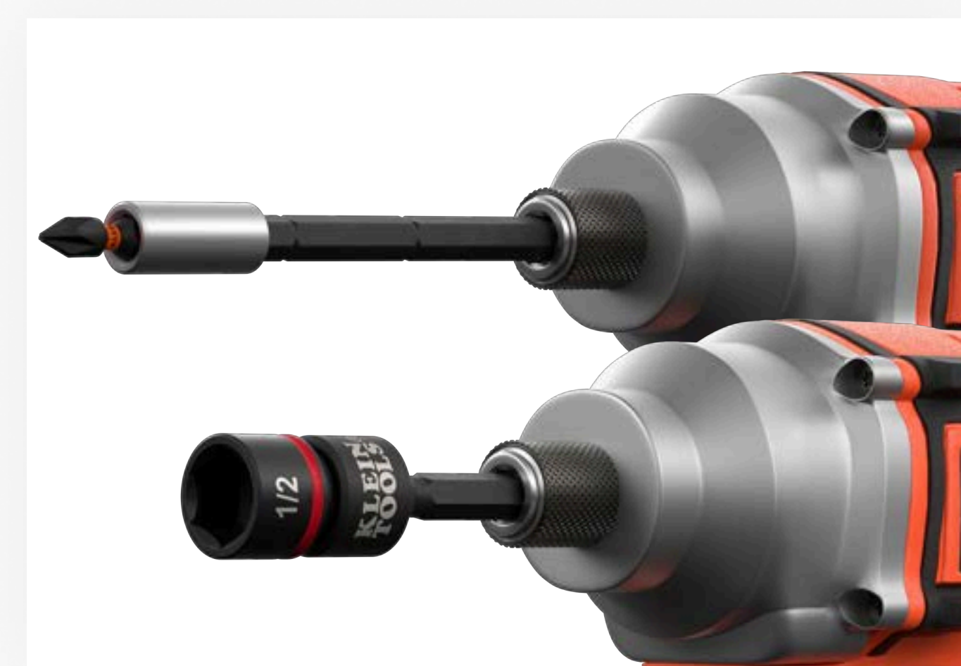
Impact Rated Components