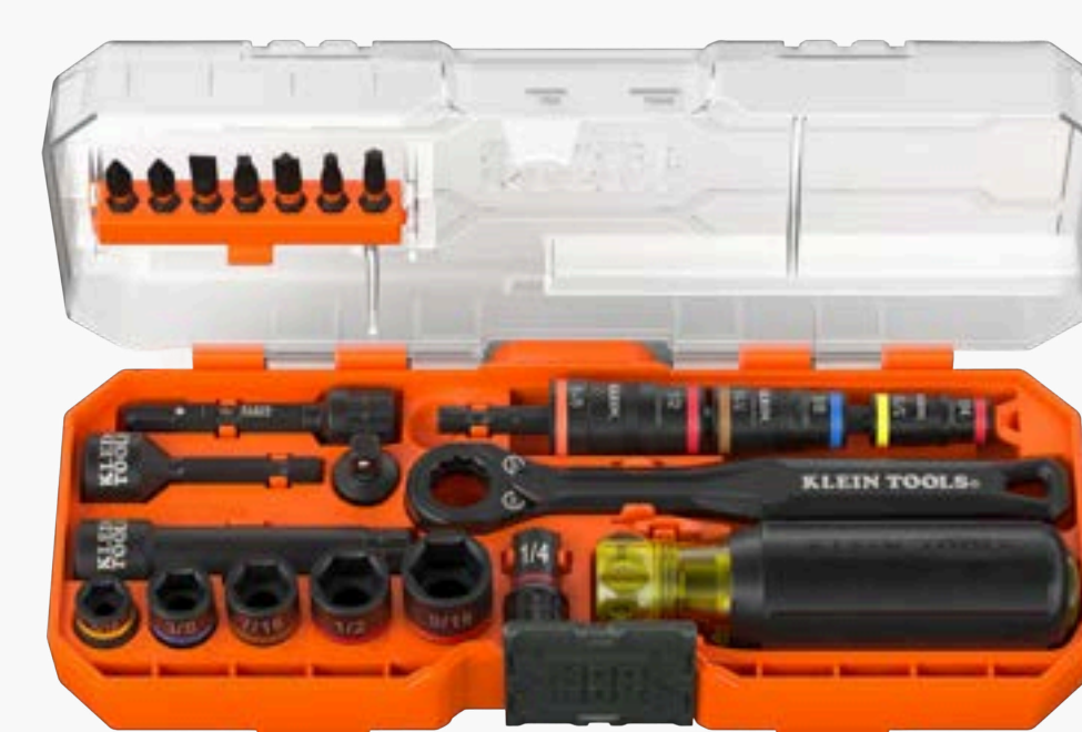
65301KNECT 23-Piece SAE Pass-Through and Flip Socket Set