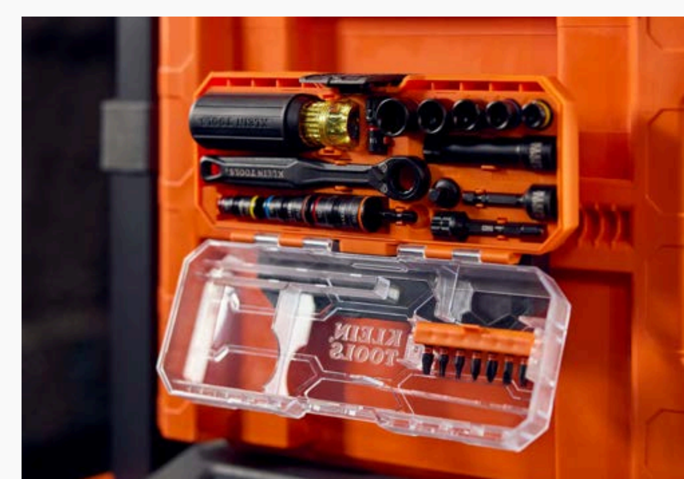
MODbox Accessory Case