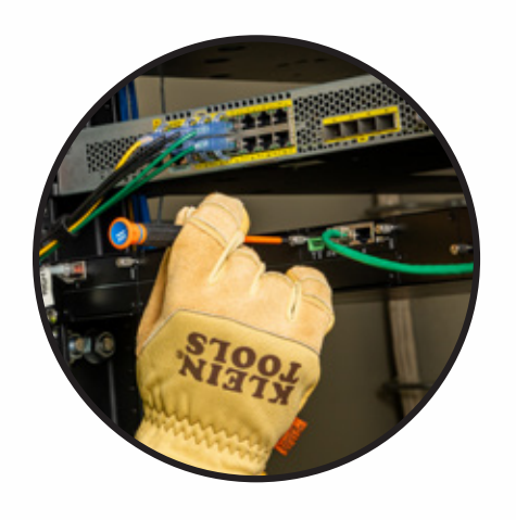
SPIN CAP FOR PRECISE CONTROL