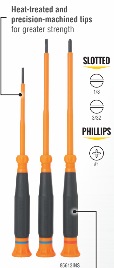
Cushion-Grip™ handles allows for greater torque and comfort