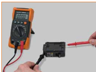
Check Circuit Breakers