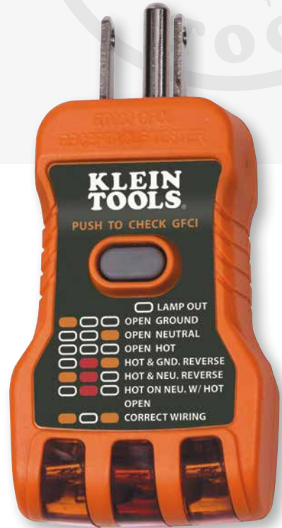
RT600 GFCI Receptacle Tester