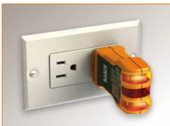
Test standard receptacles (both)