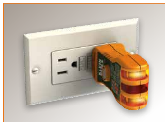
Test GFCI receptacles (RT600 only)