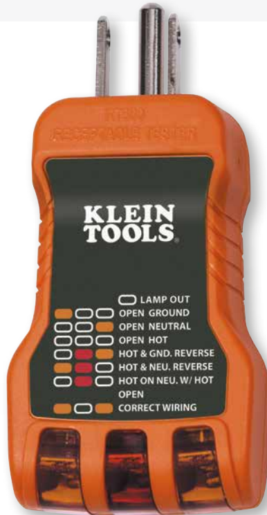
RT500 Receptacle Tester