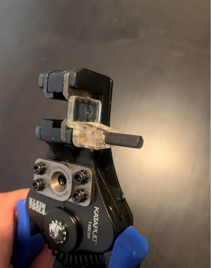
Step 3 Install the adjustable wire-stop onto the adjuster