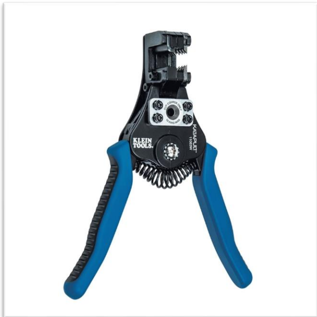
Katapult Wire Stripper and Cutter for Solid and Stranded Wire