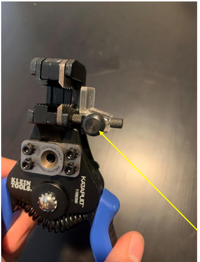
Step 4 Lock the wire-stop in place using the thumb screw.