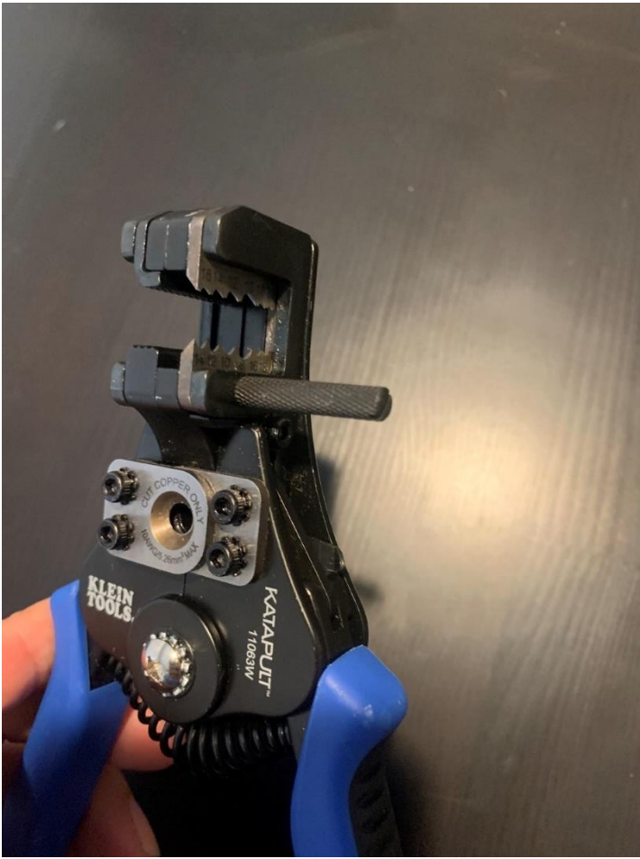
Step 2 Insert the adjuster bolt into the empty hole.