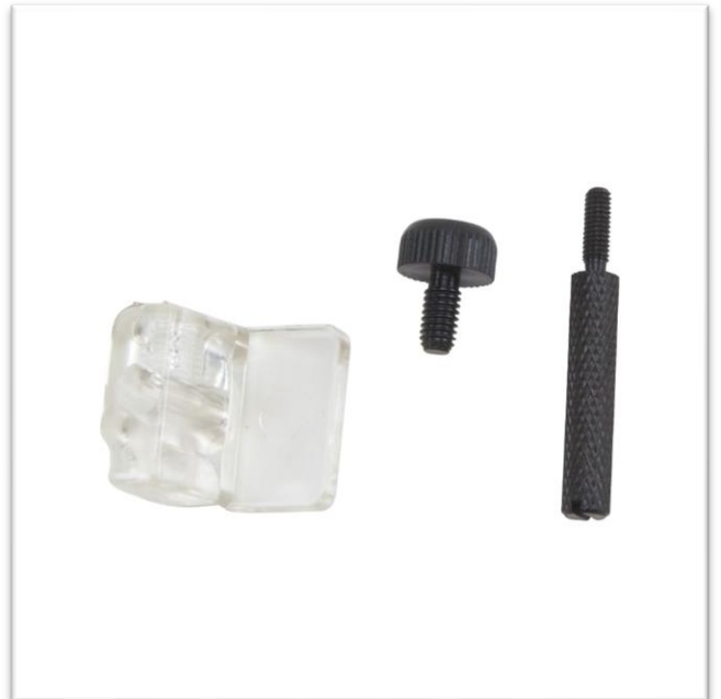
Adjustable Wire Stop/Gauge